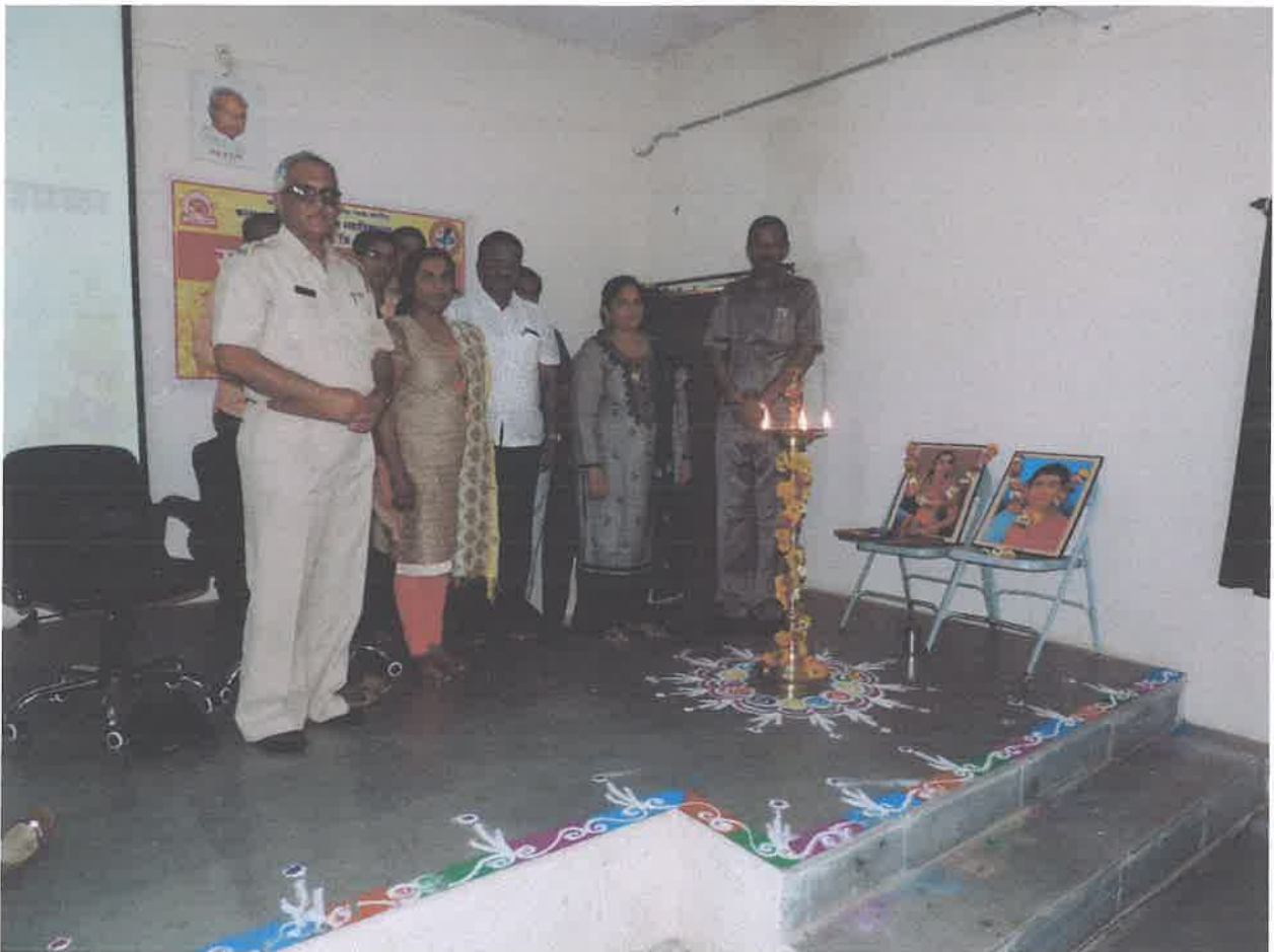
Inauguration program of legal awareness program SH