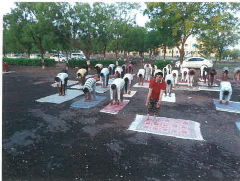
Celebrating International Yoga Day.