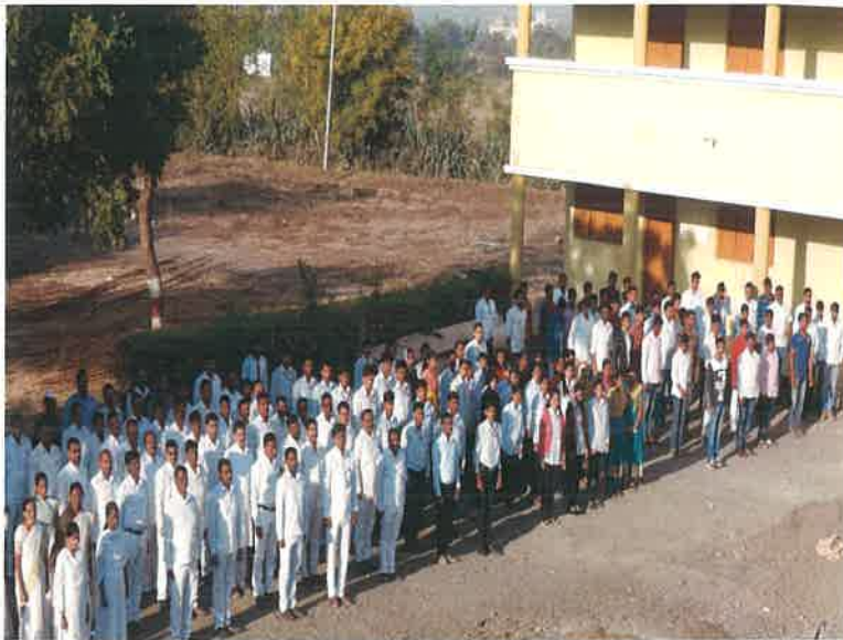
Celebrating 67th Republic Day Flag Hoisting Staff and Students.