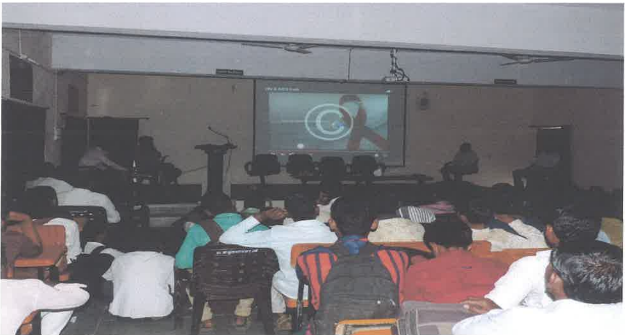
participated students in Health program