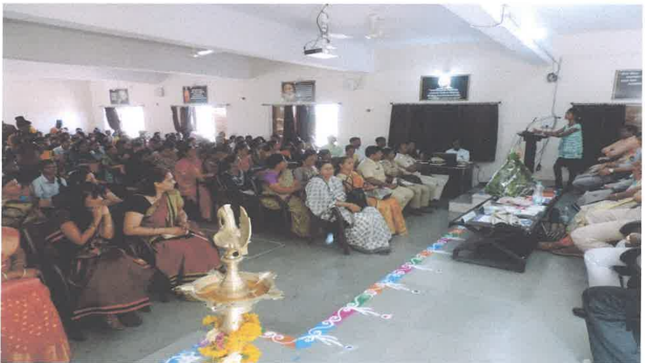
participated students, staff and people