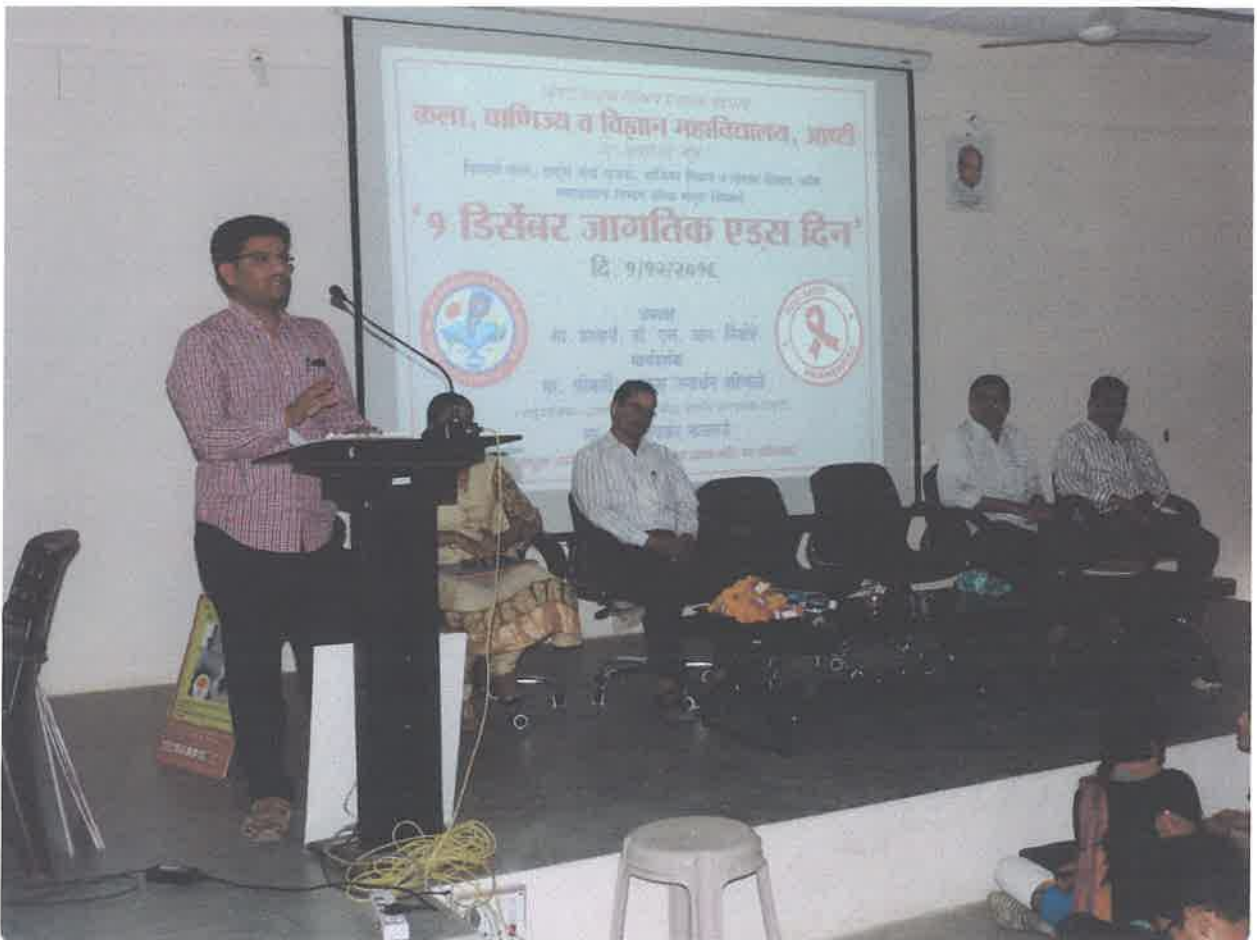
Health Guidance program and AIDS Day