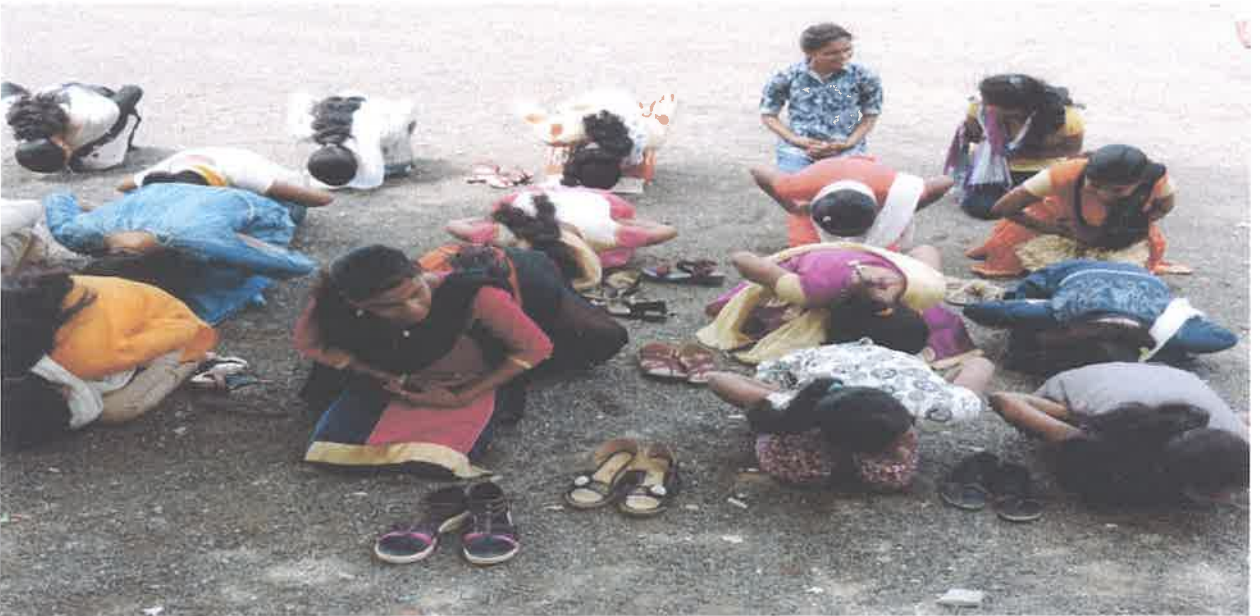
yoga program for girl student