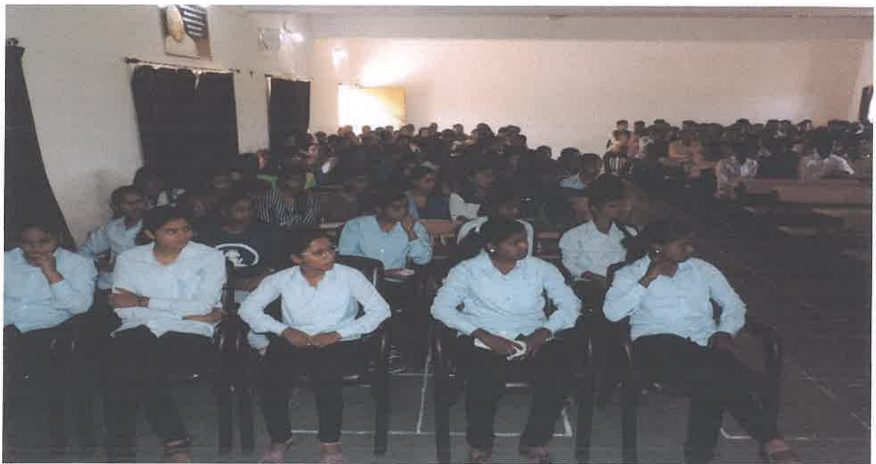
participated students in mobile literary program