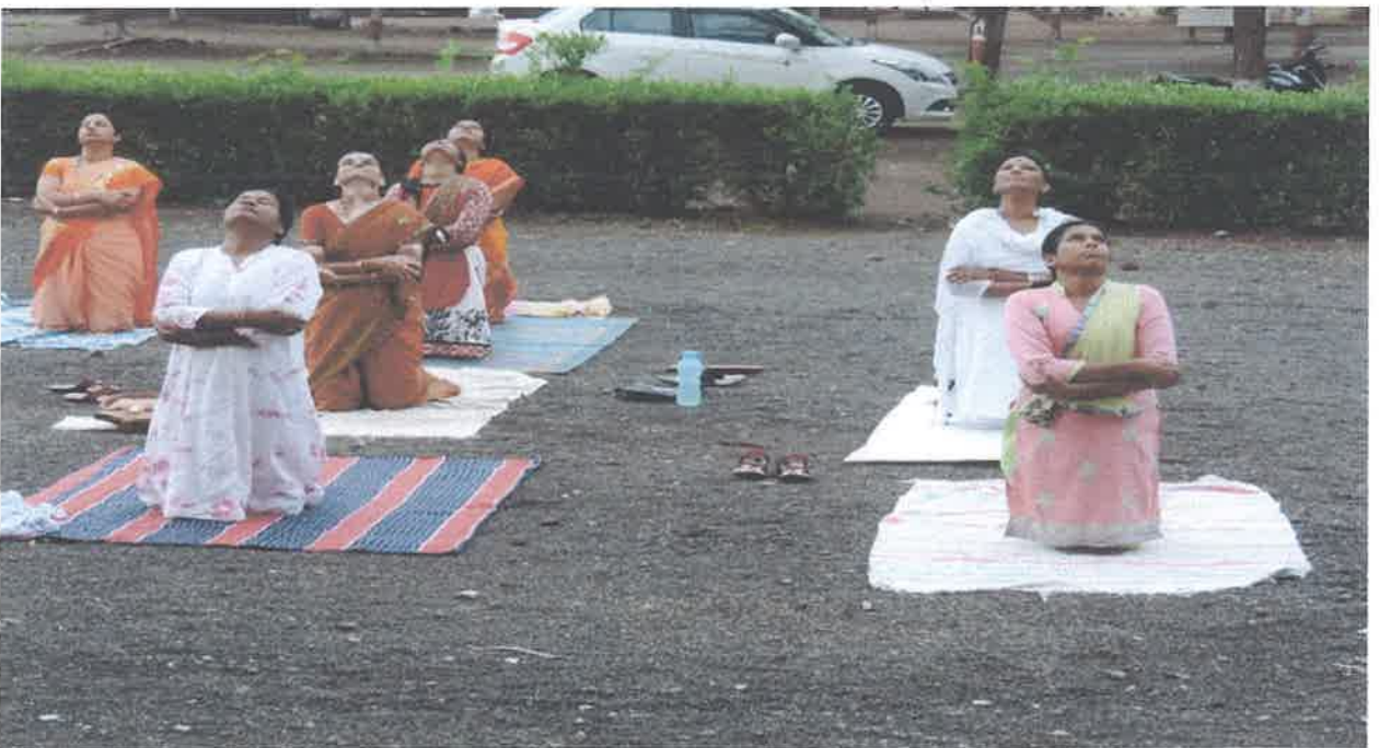
Yoga program participated staff.