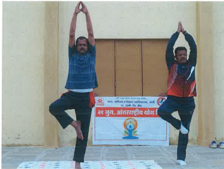
Celebrating International Yoga Day.