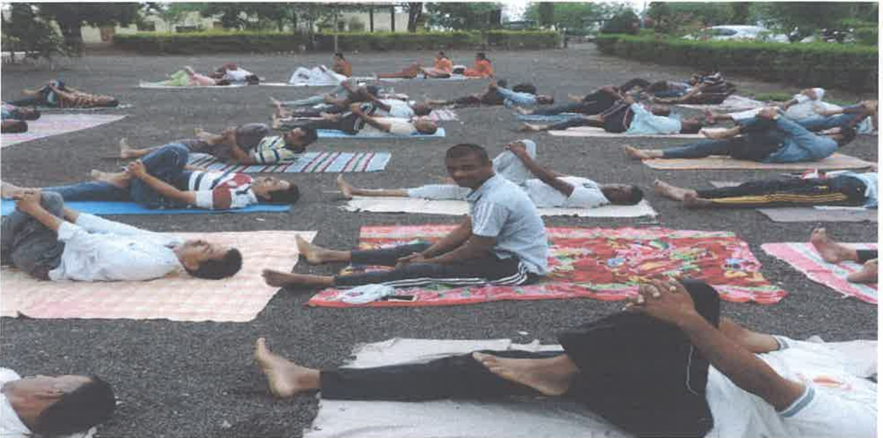
participated staff in yoga program